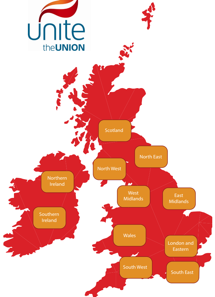
Unite the Union Regions