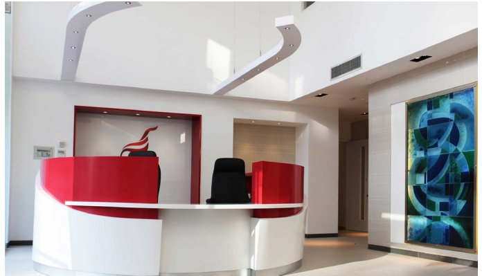
Reception at the Unite London Office

Hidden benefits to members are that calls to key offices are seamlessly overflowed to other offices if all staff are busy, making it easier to get in contact with Unite. Secure instant messaging has increased the percentage of first-time resolutions on calls from members. Call recording has meant that incidents of staff being abused has reduced and staff feel better protected.