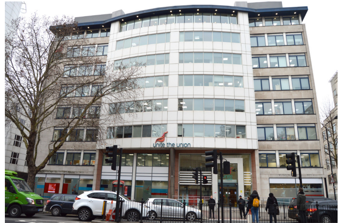
Unite the Union London Office

“Partnering with Opus has elevated the perception of the Unite IT team within the organisation. The kit is fantastic and the service and support from Opus is excellent.”